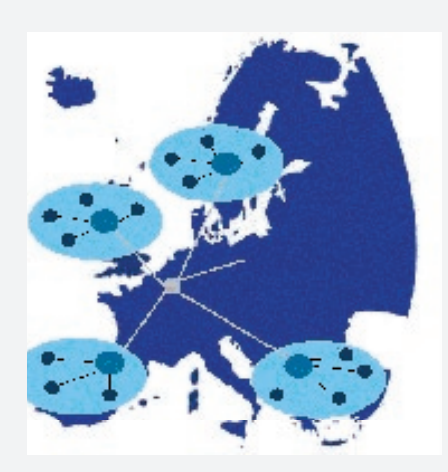
he Idea of autonomous, distributed systems is coming alive...

At the start of their participation in the European Migration Network (EMN), the software engineering team of the Technical University Berlin (TUB/CIS) sketched a long-term picture of autonomous, distributed and heterogeneous EMN information sources, which could be monitored by a Central Integration Information Service (CIIS).